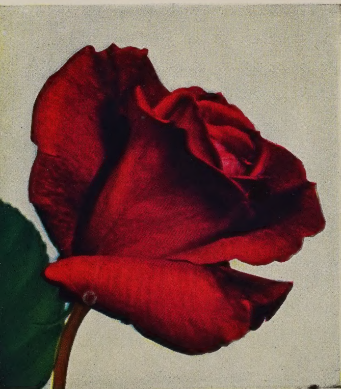
CRIMSON GLORY—$1.50 each; 3 for $3.75 (Plant Patent No. 105)

WILL ROGERS —Plant Pat. No. 256. A black velvety crimson maroon which holds its color until the last petal falls. Strong vigorous grower. Intensely fragrant. $1.00 each, 3 for $2.50.